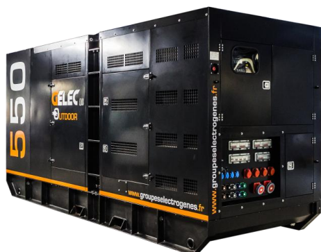
Non contractual photo